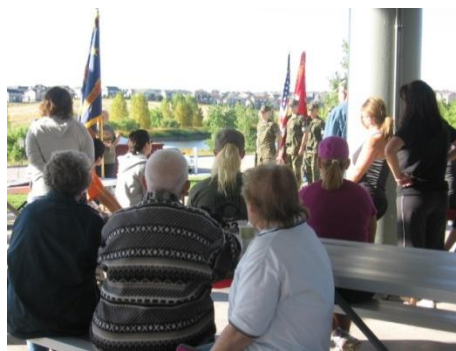
Opening Ceremonies at the 5k Run/Walk.