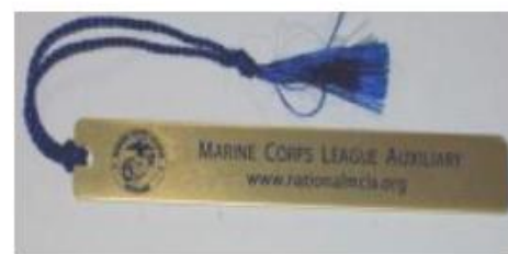
Bookmark $2.50 G30 – 288 G30 - 288