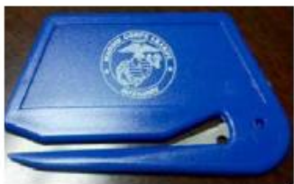
Letter Opener $2.50 G30 – 288

Many MCLA items for your personal use or that “little something” for Gift Giving