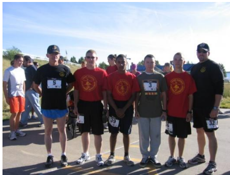
Foothills Young Marines at the starting line