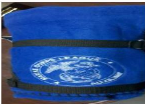
Snuggle under our MCLA Blanket $20.00 G33 -291