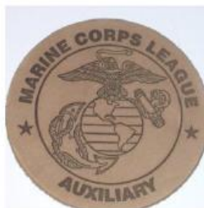
Coaster $2.50 G31 - 289