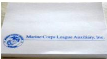
Post-It Note Pad $4.00 SS9 - 53