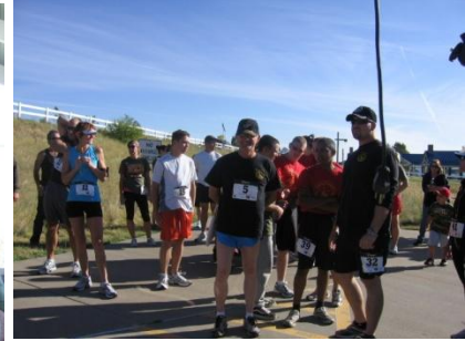
Runners at the Starting line