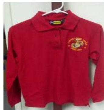
Red Polo – LS - $25.00 ( LG ) ( Size 2X - $26.00 Size 3X - $27.00 )

Many MCLA items for your personal use or that “little something” for Gift Giving