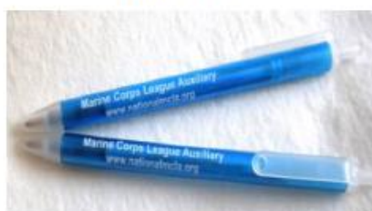
MCLA Pen $.50 ea SS24 - 255