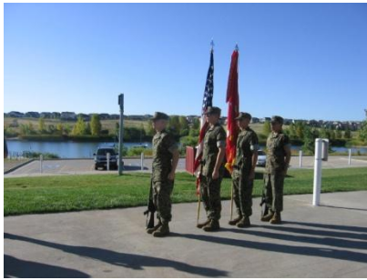
Adams City High School JROTC Color Guard