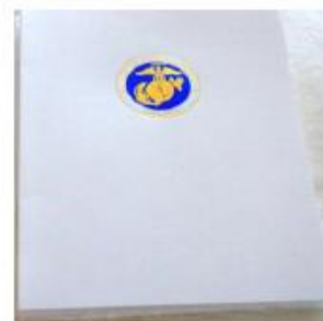
Note Cards, pks of 10 $10.00 SS8 - 52