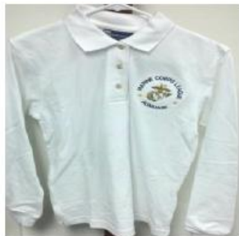
White Polo – LS - $25. ( Sizes: S LG XL )

Sunny Days, Longer, Cooler Nights - Relax Keep Warm, Read a Good Book, Send Someone A Note (SALE ON SELECTED SHIRTS)