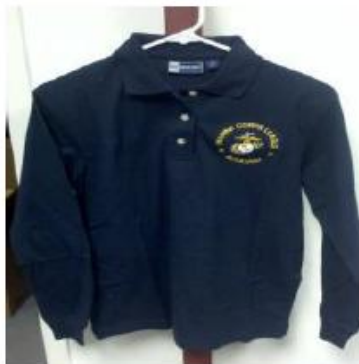
Navy Polo – LS - $25.00 ( S thru XL ) ( Size 2X- $26.00 Size 3X - $27.00 )