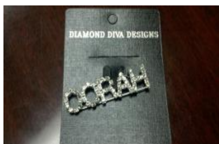
J47 - 311 SALE $10.00 Austrian Crystals