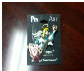
J63 - 353 SALE $ 7.00 Pewter Angel