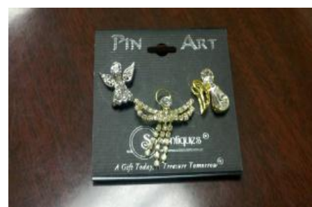
J68 - 366 Sale $ 8.00 3 Angels