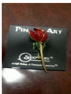
J20 - 98 SALE $ 8.00 Red Rose, Austrian Crystals

National MCLA Headquarters, 8626 Lee Highway Suite 207, Fairfax, VA 22031-2135 Phone: 703-207-0626 Fax: 703-207-2264 E-Mail: mclahq@aol.com