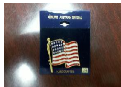
J54 - 343 SALE $ 8.00 Flag Pin