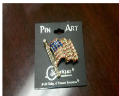
J67 - 359 SALE $ 6.00 Flag Pin